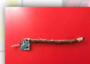
Savia Wooden Pens