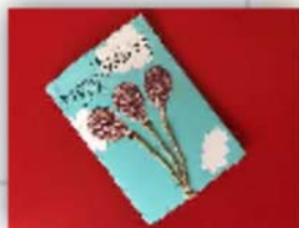
MLC Homemade Cards

A small selection of the large array of products for sale are shown below: