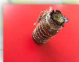
Sensational Succulent Jars